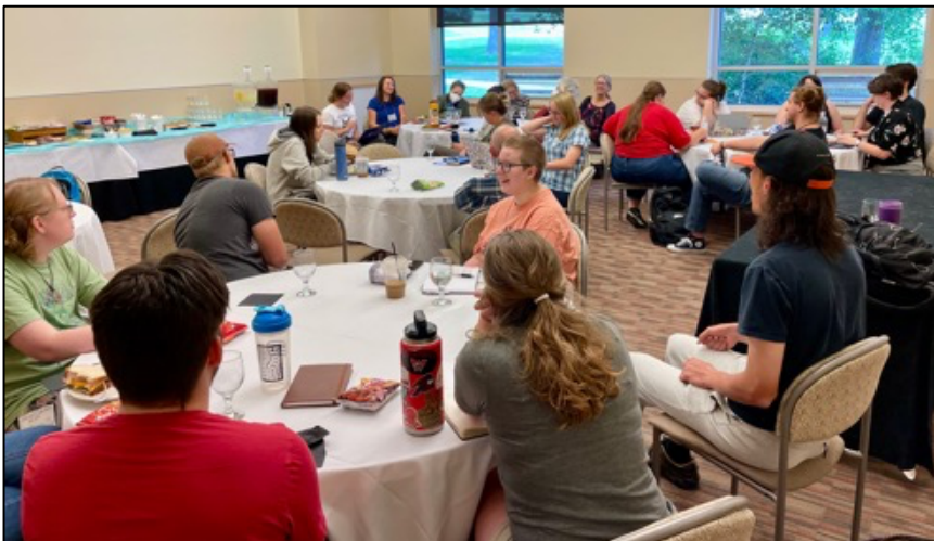
Writers gather for our lunch roundtable discussion at Story Catcher 2022 in Gunnison