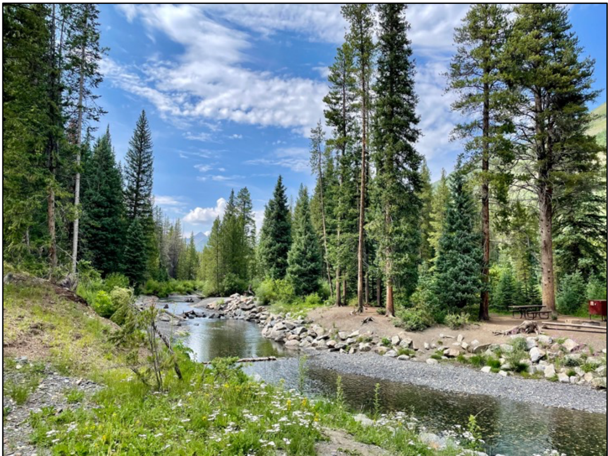
ABOVE (L-R) Festival participants at Story Catcher 2022 on the WCU Campus. MFA Students in the Nature Writing Concentration gather for a wildflower hike at the end of their 2021 summer residency. Slate River along "Oh Be Joyful" Trail, Grand Mesa National Forest, Crested Butte.

Set in the heart of the Rocky Mountains, with the Western Colorado University Campus as our classroom, and the Gunnison Valley, Crested Butte and Grand Mesa National Forest as our playground!