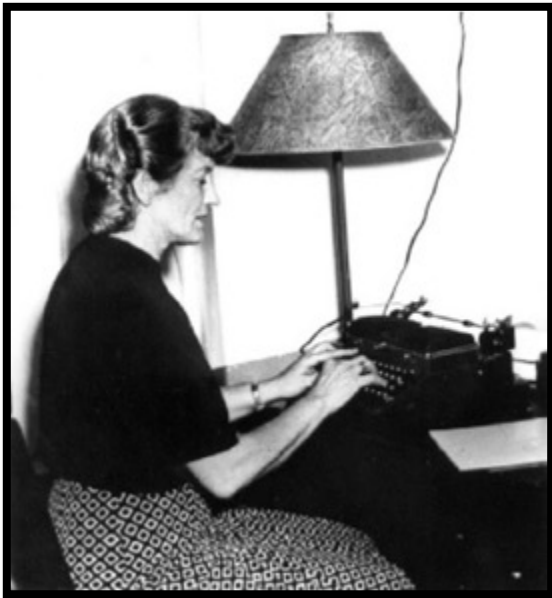
ABOVE: Mari Sandoz at work in Bernard Hall for the 1948 Writer's Institute at the University of Wisconsin at Madison.

Mari Sandoz attributed her writing success less to natural talent and more to hard work and determination (and lots of revision). She explored sweeping ideas and concepts related to the human drama, particularly as it played out on the landscape of the American West, depicted across multiple genres including ten books of nonfiction, seven novels, numerous essays, short stories, letters and collected writings. She was also a devoted writing teacher, reading and responding to the work of emerging writers of her time.