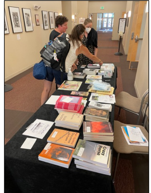
(Above) Writers purchase books and collect materials between sessions at 2022 Workshop in Gunnison.